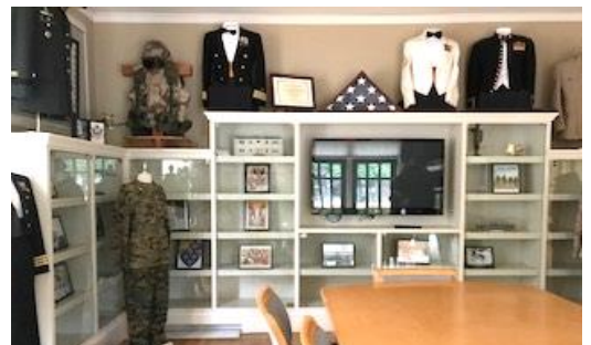
New cases in Board Room have been filled

Pointing your smart phone at the code will provide you with a self-guided tour as well as access additional information including more in-depth detail, and videos. Most cabinets also include detailed narratives, by our own knowledgeable Docents.